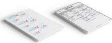
PRINTING & ELECTION CODING