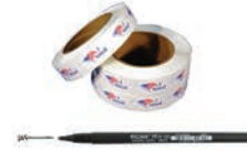
OFFICE & ELECTION SUPPLIES