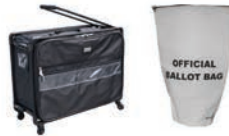
BALLOT BAGS & STORAGE