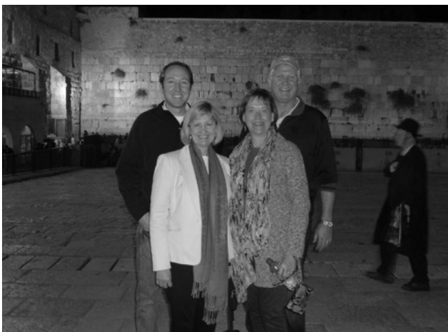
County officials outside of the Western Wall, Jerusalem