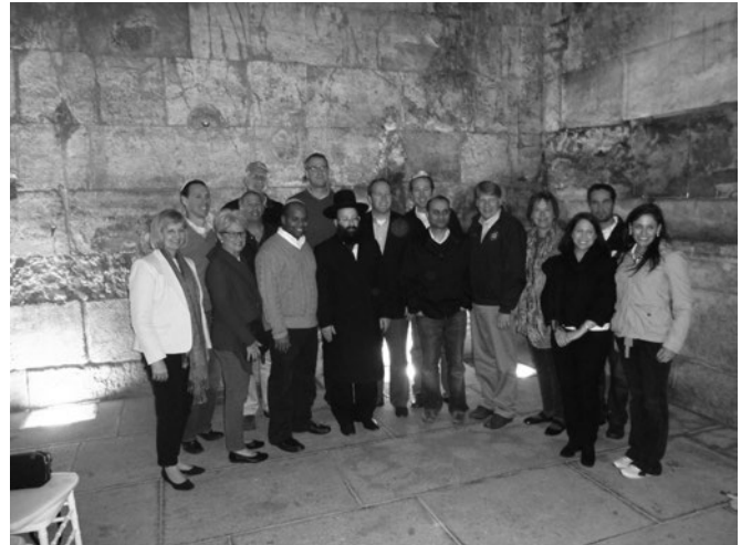
Group in the Western Wall tunnels, Jerusalem

Our final day was spent viewing holy sites, including the tunnels under the Western Wall and shopping in the Arab market. I met amazing people from entrepreneurs, to Rabbis working on reconciliation throughout the world, to Netanyahu's press secretary, varied Knesset members, and an Arab Muslim journalist living in Jerusalem. Most impressive was the Mayor of Efrat, a suburb of Jerusalem whose pragmatic problem solving could offer solutions to intractable problems. Each shared a perspective that left me with an increased awareness of the challenges faced by a part of the world that has known strife for thousands of years. I do not know if the ceasefire will hold, but there are good people there whose lives depend on it.