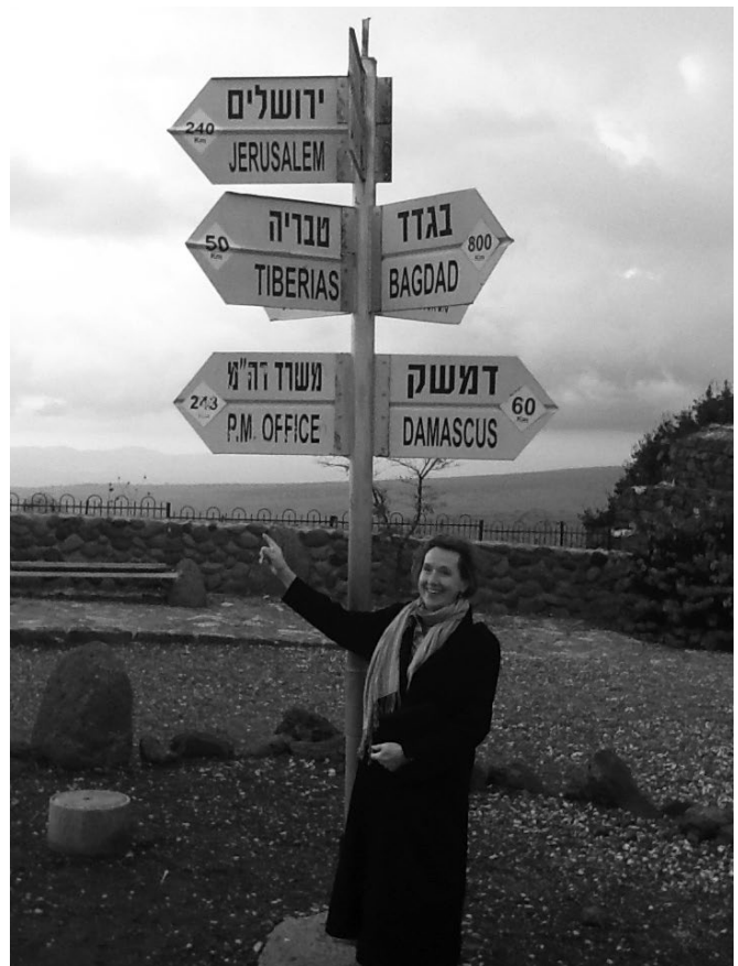
On the Golan.