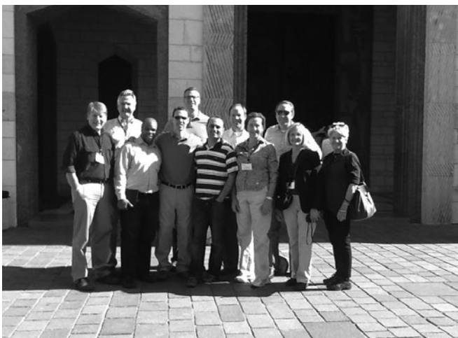
Group outside of the Church of the Annunciation, Nazareth

Returning to Jerusalem, we had to give up our trip to Gaza, as rocket fire was escalating and it became clear that it was not